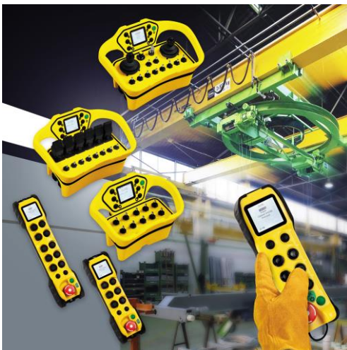
Caption: Jay Electronique manufactures industrial radio remote controls with a high standard of safety and strong capabilities to offer customized solutions.